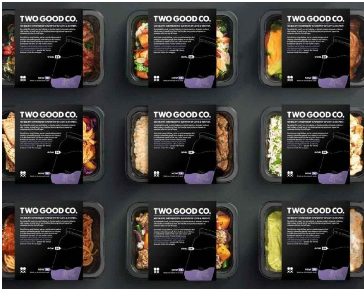
Figure-1: Too good co, products