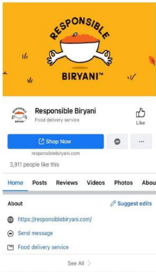
Figure-3: Facebook page of responsible biryani

Responsible biryani is quite active on Facebook, YouTube and Instagram (see figure1,2 and 3)