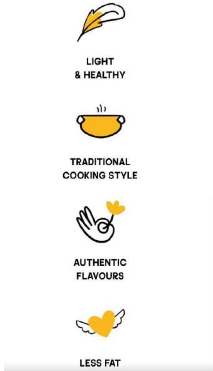
Figure-2: Specialty of responsible biryani