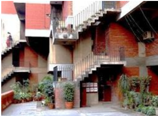
Figure 9 Tara Housing