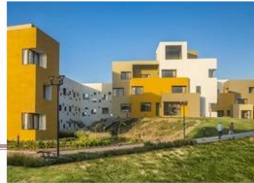
Figure 10 Studio 18 Apts.