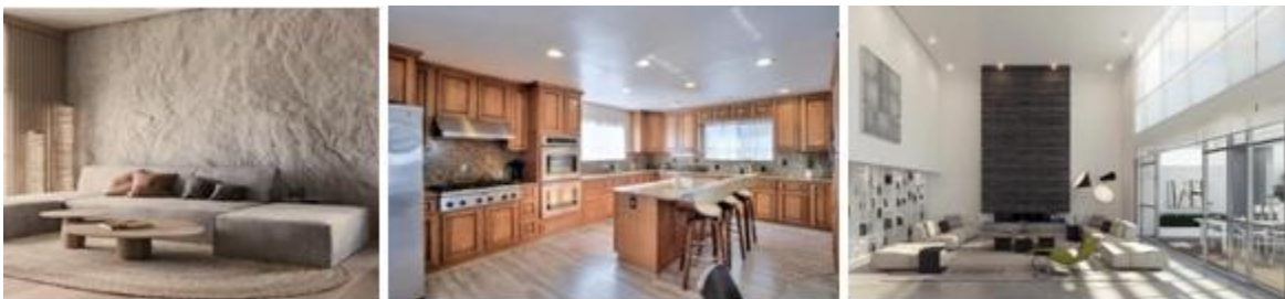
Figure 6,7,8. Design Elements: Texture, Light, Scale

The expression of proportion throughout a design is that the visual effect is created through the connection of volumes of space, also because of the balance of materials.