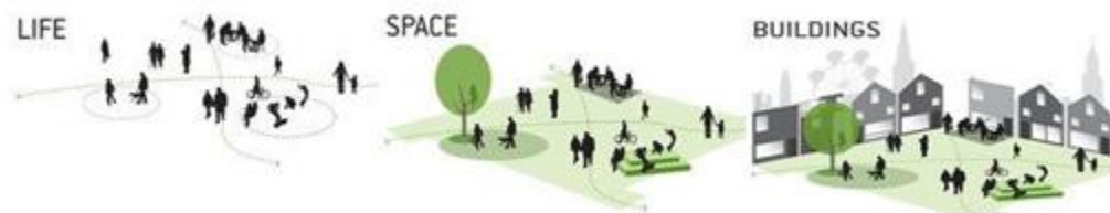
Figure 1. Life, space, and buildings

Space encompasses the volume of a structure that is the parts of the building we move through gradually constructing our experience. Architectural designs are established by creating and carvingout space by dividing it using various elements like geometry, color, texture, and shapes.