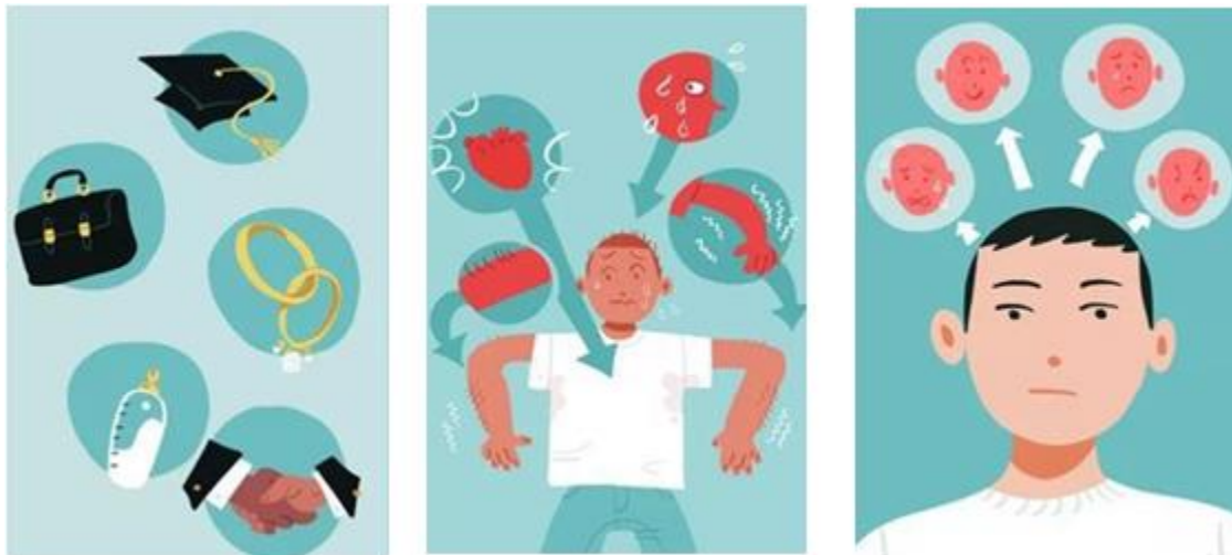
Figure 2. Subjective response, Physiological response and behavioural response

The basic human emotions like happiness, sadness, fear, anger, etc. can be combined to form complex emotions like joy, content, surprise, etc.