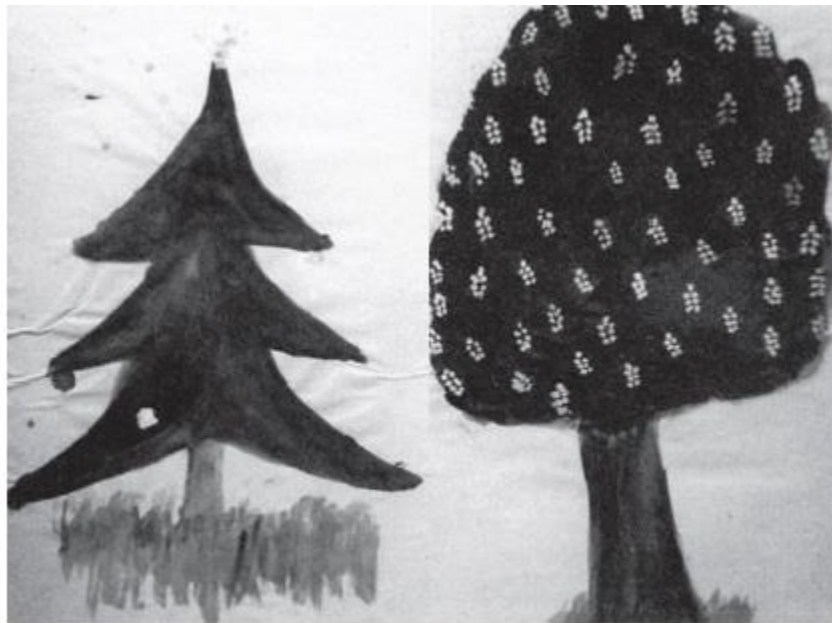
Fig 1. Pictorial Representation of the above prompt

Expression through art is different for everyone. Example, when given the prompt ‘Draw yourself as a tree’ (Image representation below), children were seen drawing different representations and art therapy helps us in understanding these differences in a unique manner (Case and Dalley, 2014).