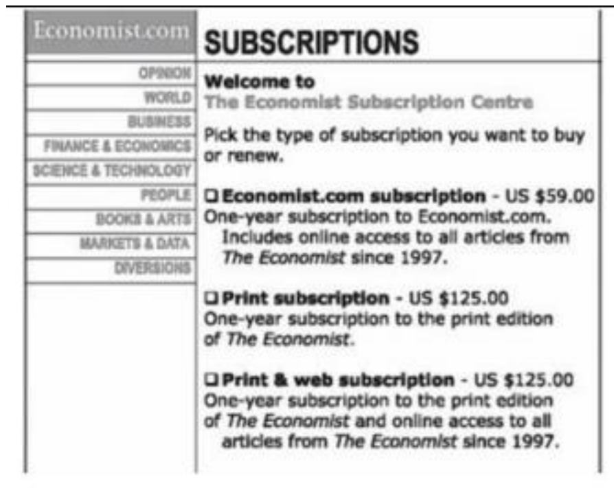
Fig 1- Economist subscription