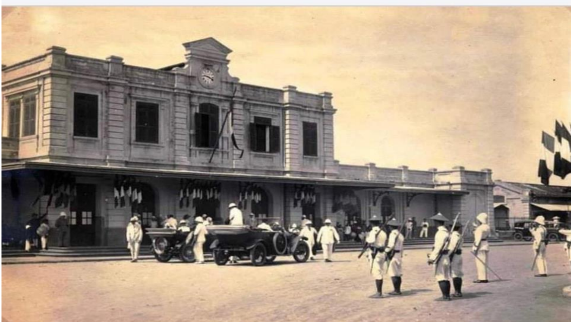
Hue Railway Station - an architectural work built in the neoclassical style