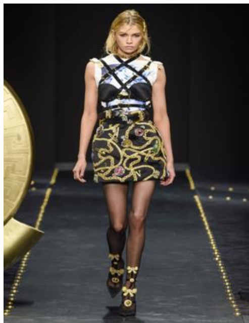
Versace Autumn/Winter 2019 show