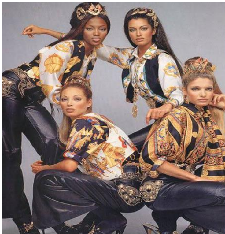
Supermodels of the 90s posing wearing clothes consisting of baroque prints