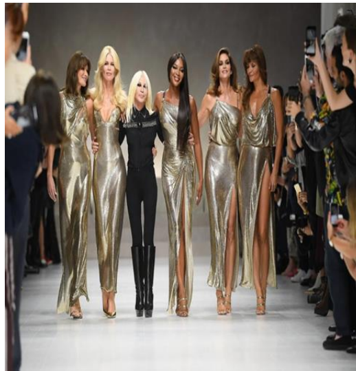
Iconic supermodels Carla Bruni, Claudia Schiffer, Naomi Campbell, Cindy Crawford and Helena Christensen close the Versace Spring/Summer 2018 show wearing Orotón dresses