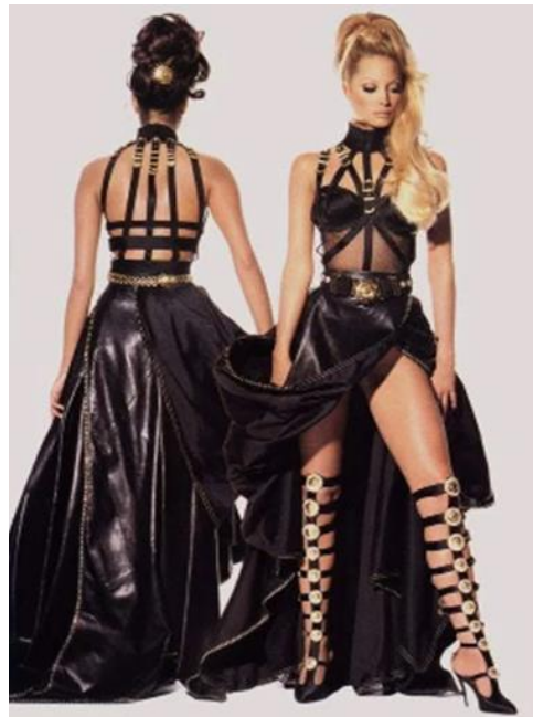
Cindy Crawford models for Versace's Fall/Winter 1992 Miss S and M Collection