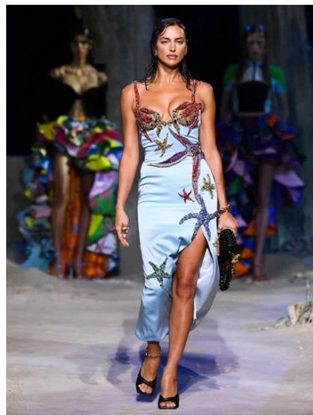
Model Irina Shayk wears a seashell dress for Versace's Under The Sea themed SS21 collection