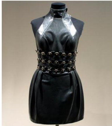
Mini evening dress, Spring/Summer 1996, Versace, leather, synthetic tulle, lace, beads and sequins