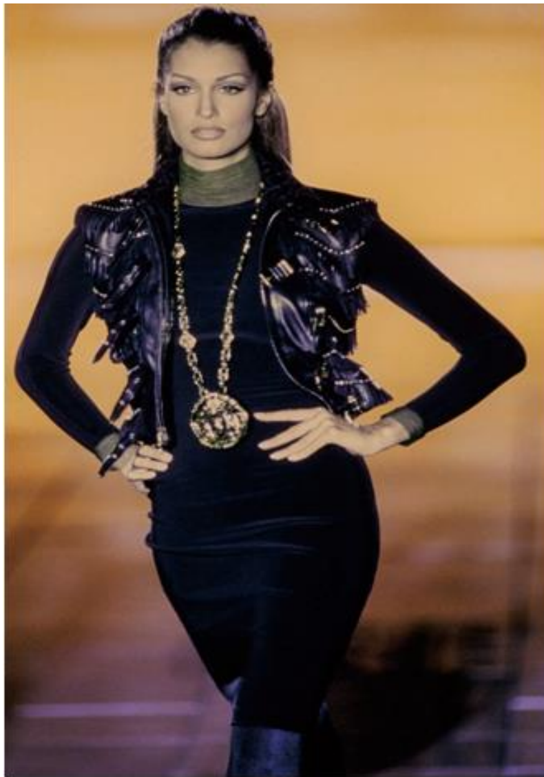
YasmeenGhauri wears a Medusa medallion necklace on the Versace Fall/Winter 1992 runway