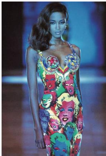
Naomi Campbell in Versace Marilyn Monroe Dress Spring/Summer 1991 collection