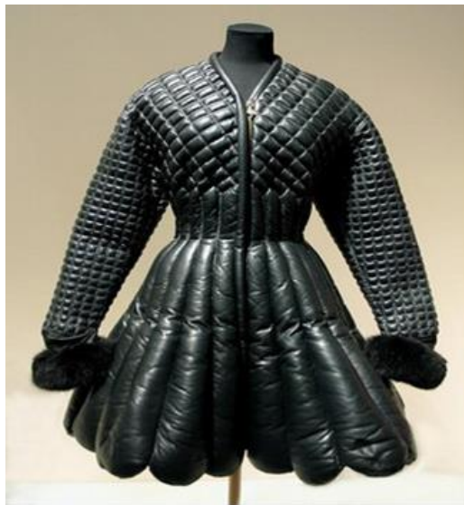
Versace coat and belt, Autumn-Winter 1992/93, padded and quilted black leather with fox fur and astrakhan trim, black leather with gilded embellishments

Versace was determined to breathe new life into daywear. He embellished finely tailored suits with risqué details like bondage-like fastenings or seductive pleats, created sensually tactile leather outfits, and clothed men and women in exuberant designs from head to toe. Versace created garments that could not be ignored by combining skilled craftsmanship with new materials.