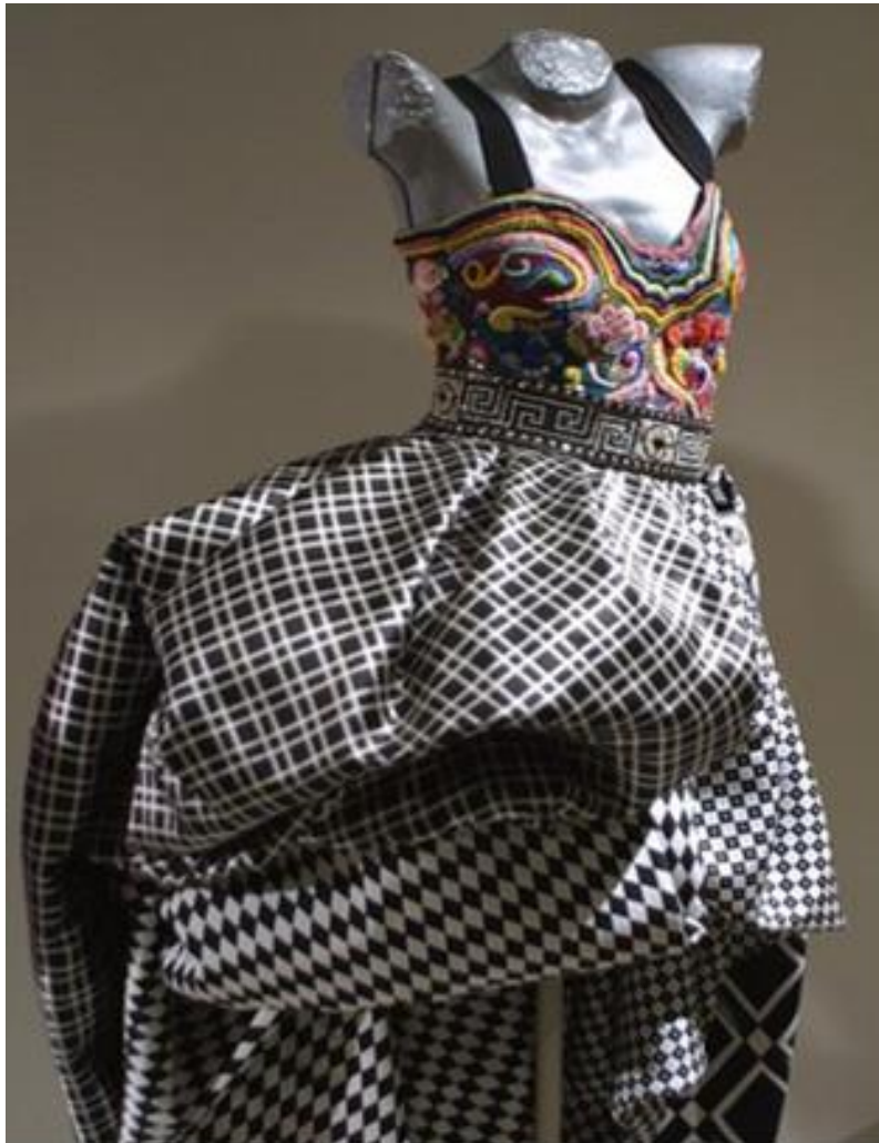
Evening ensemble, bodice, skirt and belt, Autumn-Winter 1990/91, Versace, black net embroidered with multicoloured silks, sequins and diamantés, satin, duchesse satin and faille printed with various black and white geometric patterns