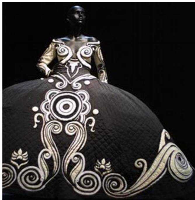
Theatre costume, Versace, 1987, black quilted satin and white satin with black and white appliqué