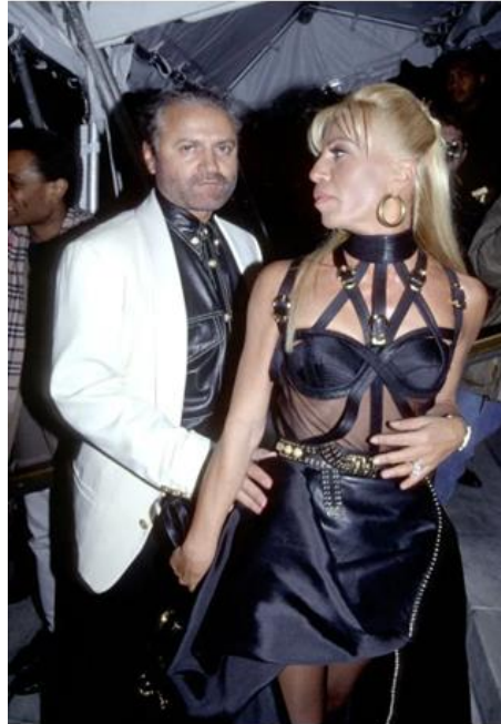
Donatella wears a Versace bondage dress in 1993