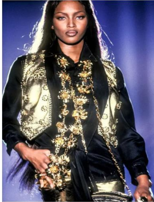
Naomi Campbell walks the Atelier Versace Fall/Winter 1992 show