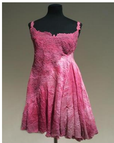
Dress, Spring-Summer 1994, Versace, 'crumpled' tie-dyed silk with machine-made lace

Versace was a man with boundless energy and excitement. He enjoyed all types of creation and visited institutions such as the V&A. Versace felt strongly about his background and the function of clothes, saying, "I come from a land with a rich history... its roots are old, ancient roots, that knew the aristocracy of sculptural draperies." Versace's extensive knowledge and reverence for the past set him free. He established a daring balance between the past and the modern that was never insulting.