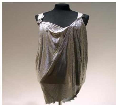
Cocktail Dress, Spring/Summer 1994, Versace, Silvertone Orotón

Versace is most well known for his tight, sensual 'celebrity' dresses, but he also adored creating conventional full-skirted ballgowns suited for socialites. He produced various evening designs in Orotón, the one-of-a-kind metal mesh 'fabric' he invented in the early 1980s, manipulating its weight and fluidity to create dazzling carapaces reminiscent of ancient drapes. Versace's 1989 Atelier haute couture collection was influenced by his love of overstatement. Sequins, diamantés, and metal strands were carefully stitched on micro-dresses and skintight jumpsuits. Versace, on the other side, experimented with structure and drama in a series of austere black dresses with opposing personalities. They were simple on the outside but featured wickedly plunging necklines and slit skirts on the inside.