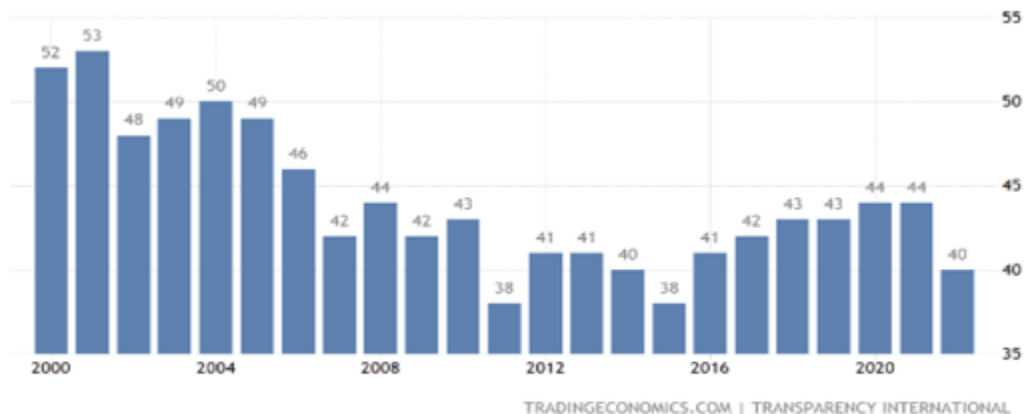
Figure: Tunisia's Corruption Perceptions Index