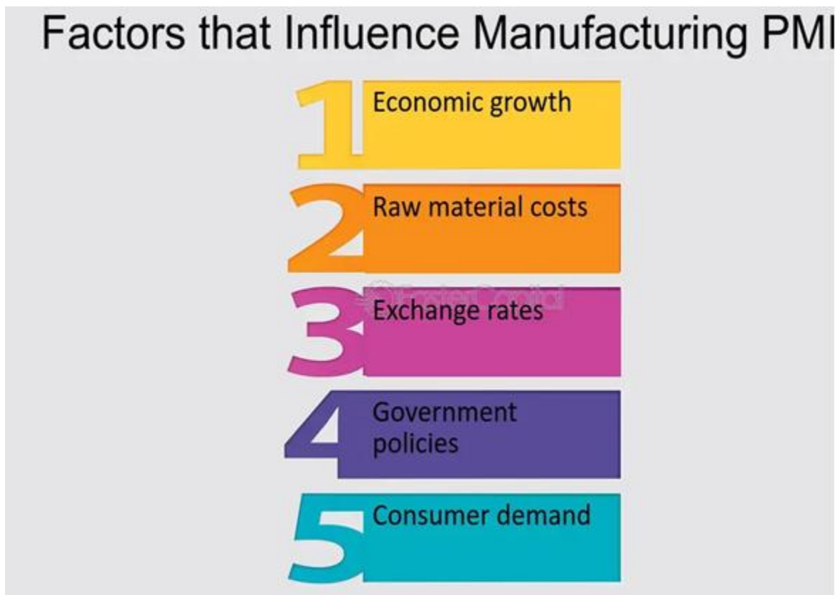
Fig (Factor Influencing PMI)

PMI readings go down as a result. Thus, aside from government policies and regulatory frameworks, which have a considerable effect on PMI fluctuations in India's manufacturing sectors, the government is also one of the most significant drivers of fluctuations in PMI. The level of taxes, trade tariffs imposed, investments in infrastructure, labour regulations and environmental standards are all cases which can directly influence manufacturing activities (Lea, 2021). How that can be seen is that on the one hand, a pro-business policy supporting ease of doing business and attracting foreign investments can raise the manufacturing sector's confidence to reveal higher PMI readings. On the other hand, slow industrial production processes caused by strict regulations or policy unclear may dishearten the business sentiment which can result in lower PMI levels.