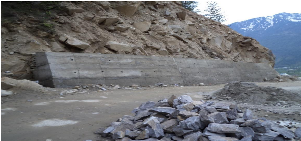
Figure 5: Retaining Wall Near Nehru Kund, Manali

Provision of sufficient weep holes with proper filtering is more essential for retaining structures (Figure 5). The height of the retaining wall depends on the calculated risk factor of a particular landslide spot. Construction of retaining wall in the study area is strongly recommended for the Nehru Kund site to get the terrain stability as well as avoid further slope failure conditions.