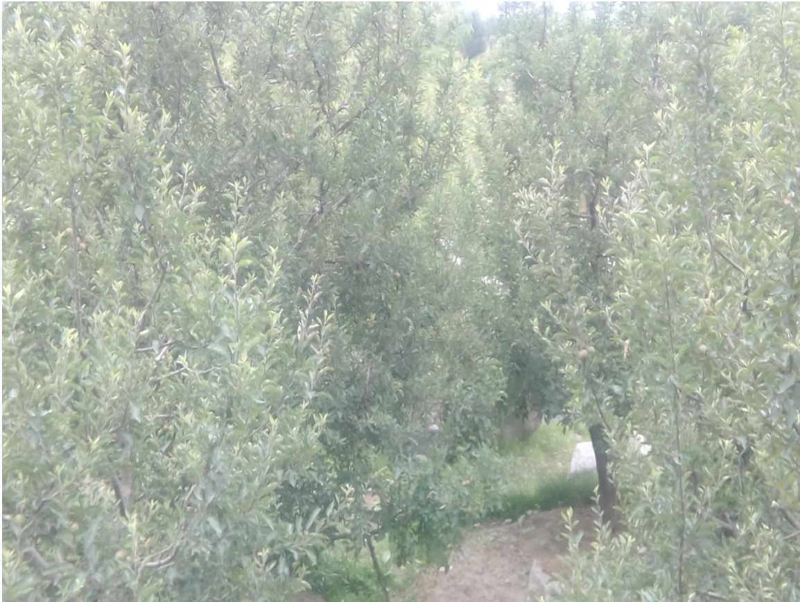
Figure 7: The Afforestation Programme Near Kulang Village, Manali