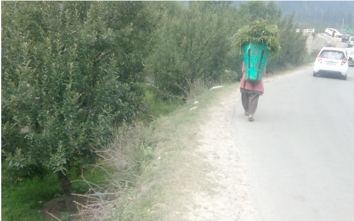
Figure 6: Apple Orchard Near Palchan Village, Manali

Some other methods like grass seeding, tree or shrub seeding, bamboo planting and turfing reduce landslides impacts and it holds some potential applicability between Kullu-Rohtang Pass area.