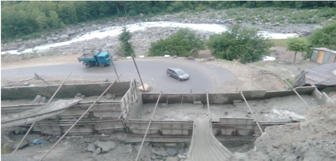
Figure 2: Construction of Stability of Slope on National Highway-21

Road construction and growth of unplanned settlements along the steep slopes near the upper the Beas basin area, Palchan and Kothi village are the main causes of slope instability in the study area. So, the preventive steps should be taken by government to control these activities and prepare a policy for slope based construction of settlements.