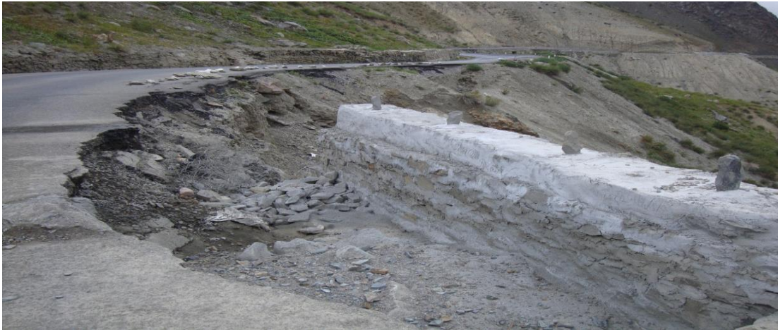
Figure 3: Effect of Proper Drainage System in Bhang Village, Manali

The most important triggering mechanism for mass movements is the water infiltration into the overburden during heavy rains and consequent increase in pore pressure within the overburden. Hence, the natural way of preventing this situation is by reducing infiltration and allowing excess water to move down without hindrance. As such, the first and foremost mitigation measure is drainage course correction and promotion of water harvesting measures. This involves maintenance of natural drainage channels both micro and macro in vulnerable slopes. If the drainage system is scientifically planned and designed between Kullu-Rohtang Pass than future occurrence of landslides events will decrease (Figure 4).