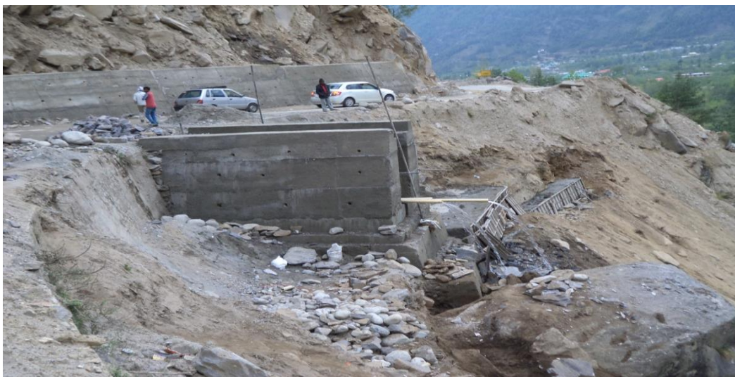
Figure 4: Planned Drainage System Near Palchan Village, Manali

The most important triggering mechanism for mass movements is the water infiltration into the overburden during heavy rains and consequent increase in pore pressure within the overburden. Hence, the natural way of preventing this situation is by reducing infiltration and allowing excess water to move down without hindrance. As such, the first and foremost mitigation measure is drainage course correction and promotion of water harvesting measures. This involves maintenance of natural drainage channels both micro and macro in vulnerable slopes. If the drainage system is scientifically planned and designed between Kullu-Rohtang Pass than future occurrence of landslides events will decrease (Figure 4).