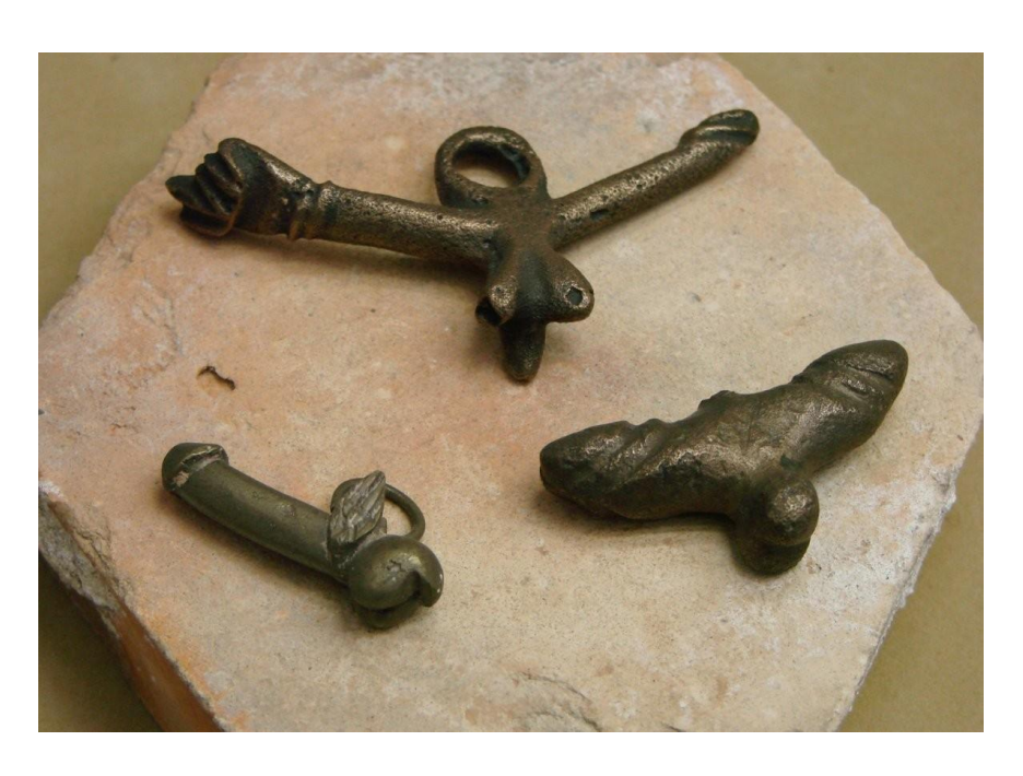
Gallo-Roman examples of the fascinum ("the divine phallus") in bronze, Rome