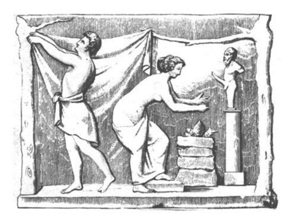
Envocation to Priapus: 19th Century Engraving of a Bas-Relief from Pompei; Source: Sacred-texts