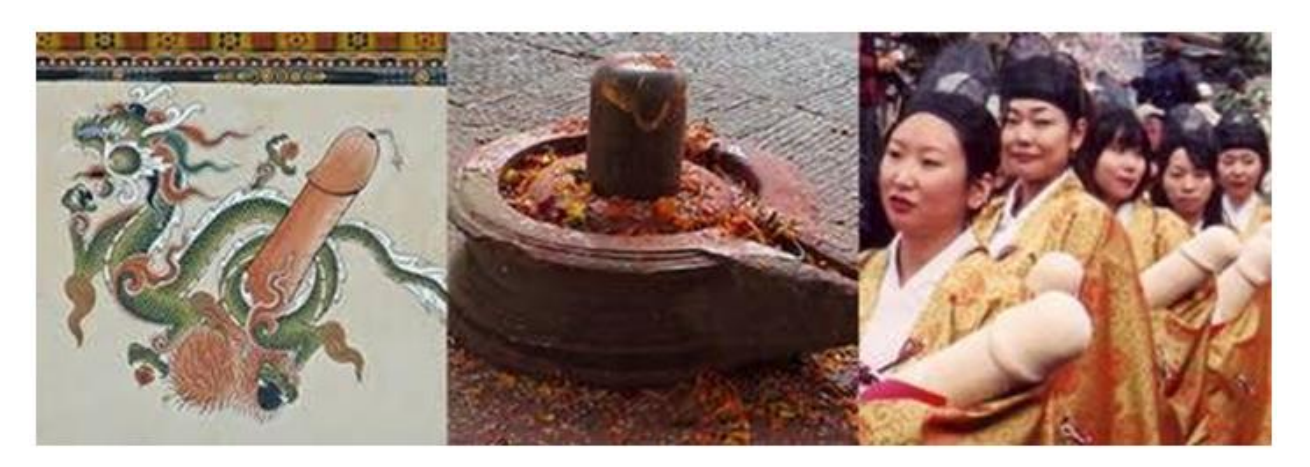
Images of phallic worship across Bhutan, India and Japan

identifying him along ascetic ideals. The common disdain towards the material world reveals itself in to ways- asceticism, where one hopes to overcome material pleasure and be one with Shiva, where sexual activity is prohibited; alchemy, where one hopes to take over materialism, and sexual activity is merely ritualistic. Even though both these views bear no cognisance with the pleasure and 'generation' through sexual activity; the ritual representation of Shiva is a phallus. The representation of breasts in the Brahmanical past has always been kept away from art historically. The focus has been on the Lingam (Phallus) as the symbol of fertility in the imagery defining Indian history. This is symbolic of the lack of representation of women within Indian mythology.