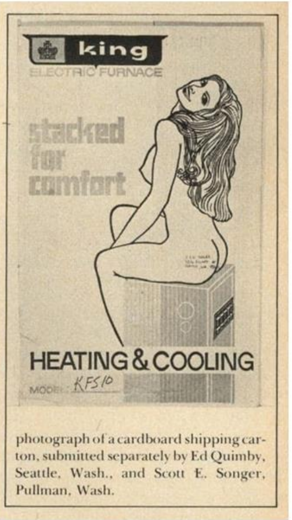
Advertisements standardising the idea of a 'built' woman