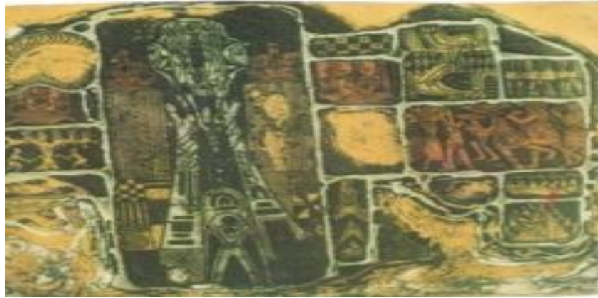
Ominira (Plate 13)

In the print, Onobrakpeya uses curve lines to create an impression of liquid substances. At the upper section of the print are: (1) three vignettes of small soldier ants working hard to sustain their queen (2) mountain climbers bound together by the same rope and (3) masquerades from different ethnic groups coming together to celebrate Nigeria's freedom from colonial rule. These activities portray unity in diversity. Also, at this upper section of the print are motifs of masquerades: assembly of persons wearing masks.