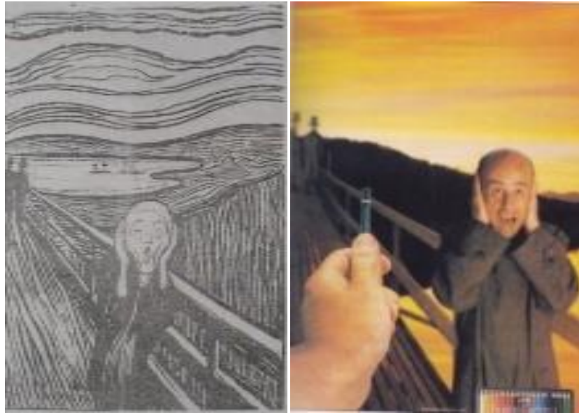
The Cry (Plate 11) Scream (Plate 12)

Bruce Onobrakpeya's artwork titled: Ominira (Plate 13) is a plastograph measuring 45cm x 60.3cm produced in 1991. The concept: Ominira is derived by Onobrakpeya from the textuality aesthetic and/or literary couch of the Yorùbá in the South-Western Nigeria that means freedom/independence to foster the expression of his artistic consideration. The work was done by Onobrakpeya to celebrate Nigeria's attainment of independence. According to Onobrakpeya (1992: 220) "the picture is a reference to the birth of new states, which brought the total to twelve in the Nigerian federal system".