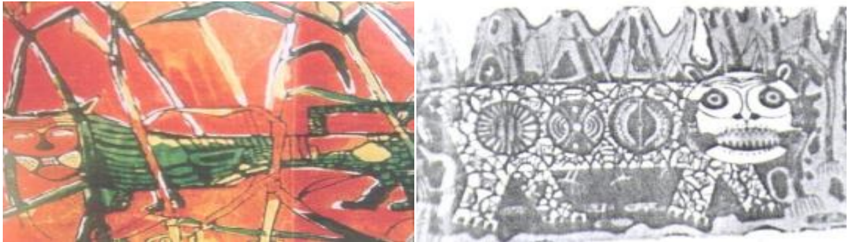
Leopard in a Cornfield (Plate 6) Leopard in the Cornfield (Plate 7)