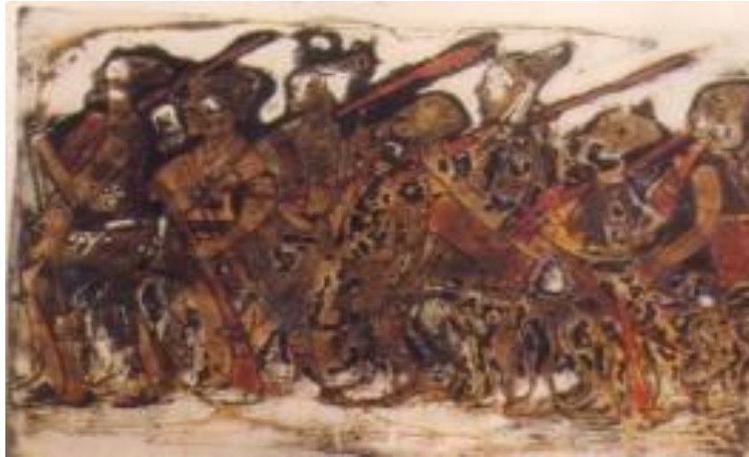
Seven Hunters (Plate 5)

dramatic stage as: Langbodo by Wale Ogunyemi during the Black Festival of Art (FESTAC 77) in Lagos.