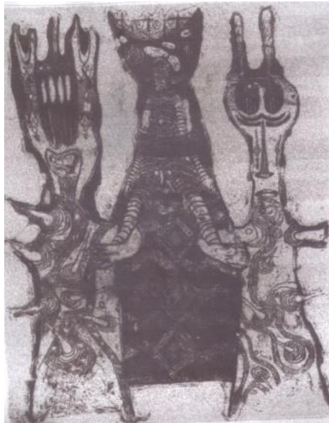
An Encounter...(Plate 4)

The decorative patterns on the body of the ghosts and the boy can be categorized into four such as diamond, circle, triangle and square. The images of the ghosts combine both zoomorphic and anthropomorphic shapes. The copper ghost on the right side of the panel has a head surmounted by animal horns. Its form is treated with the neck showing an elongated proportion. The golden and silver ghosts have rigid formula of facial appearance that shows horn headdress. In African society, the images of ram with such horns are mostly used as altar piece and mask. In Yorùbá tradition, representation of horns and ram-like head signifies sacrifice: an implication that the boy might be killed for a special religious ceremony as an offering to a god.