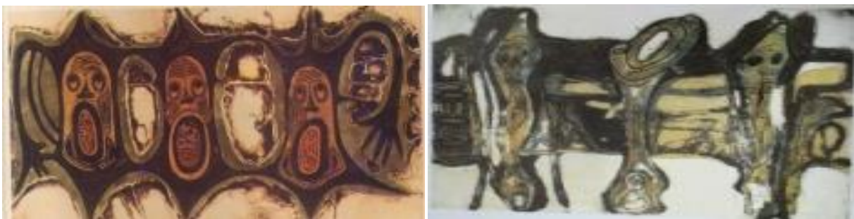
Cry of Three Spirits (Plate 9) Three Standing Figures (Plate 10)

Faber-Castell, one of the greatest producers of art materials world-wide had, however, parodied Edvard Munch’s The Cry (Plate 11) and christened it Scream (Plate 12) to modify concepts and to create a humorous appeal to crayon and pastel buying audience. Faber-Castell parodied this classical piece perhaps to suggest that “myriads of artists’ world-wide can use its products to create their own work of art” (Arens, 2004: 389).