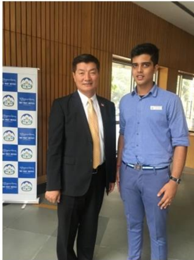
President of C.T.A., Dr. Lobsang Sangay

The following post by a Tibetan blogger on a Chinese-language website October 2012, captures the harshest level of securitization in Tibet. 35