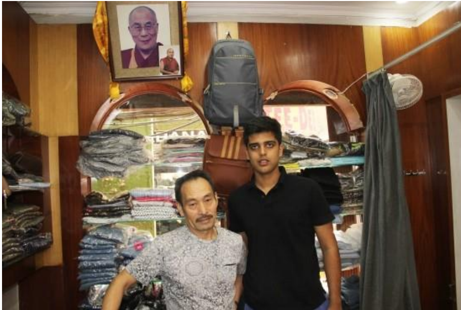
A Shopkeeper of the Tibetan Refugee Camp