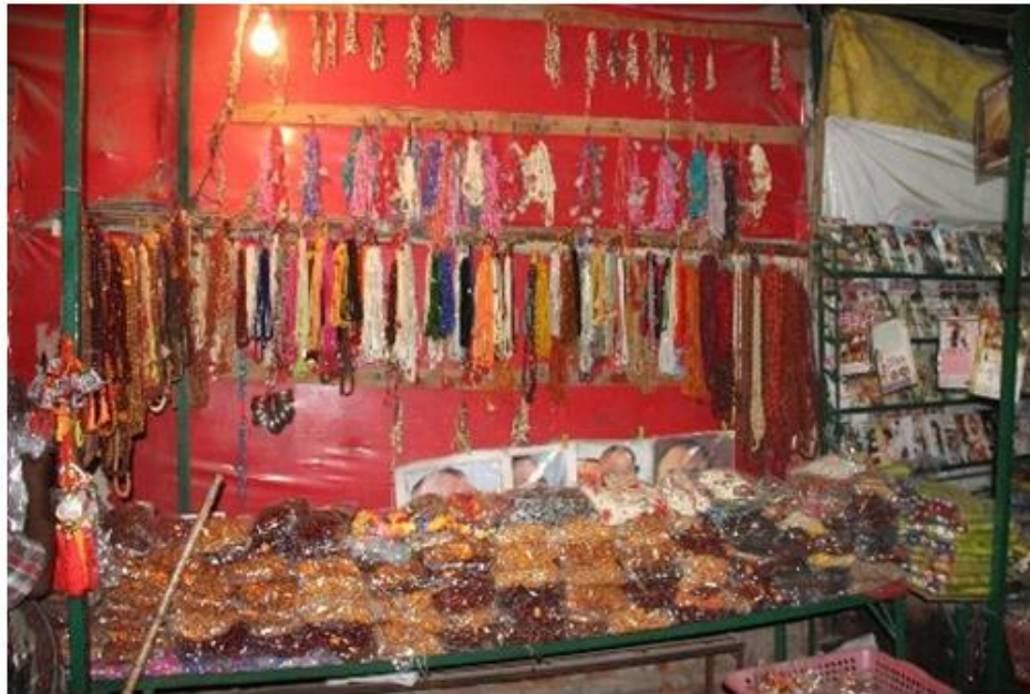
Shopping Area in the Refugee Camp (Delhi)