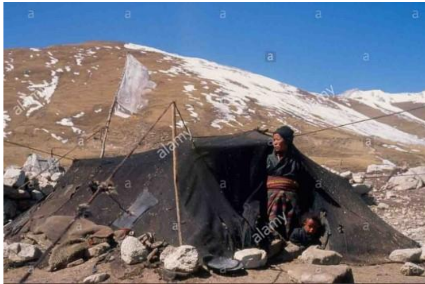
Tent in which Drogpas live

light their homes, ropes to tie animals, thus living a self sufficient life. Their relocation to urban areas will wipe out their unique livelihood and the eco system they lived in. Nomads for centuries have protected the environment by treating it with a divine angle and thus maintained the grasslands , wildlife and rivers that sustain them all.