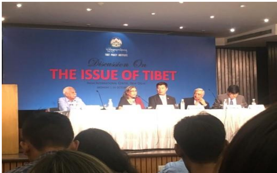
An open discussion on Tibetan Refugees